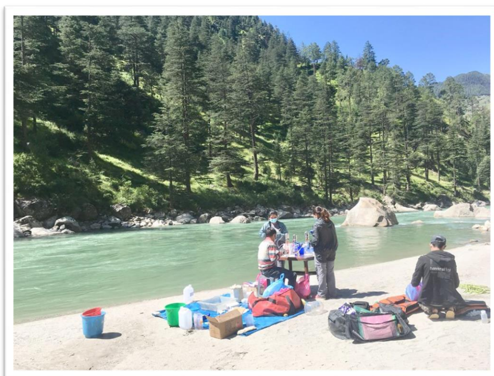
Members of the study team processing eDNA samples.